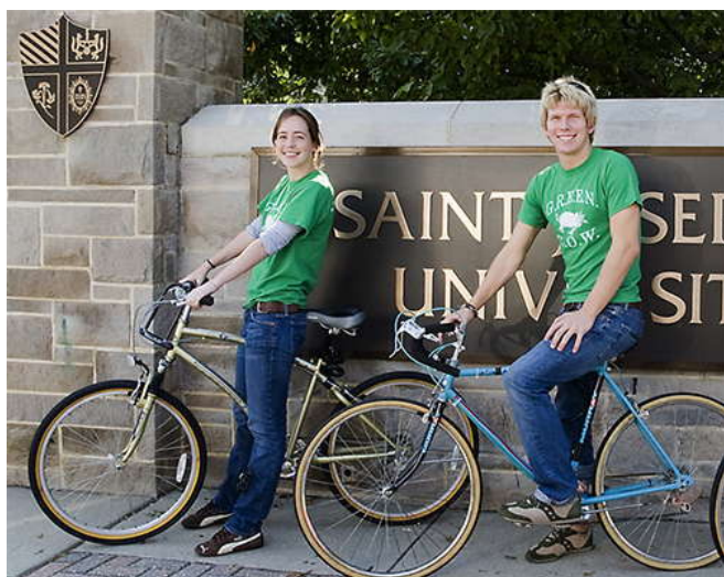
Saint Joseph's University Bike Share Program

PERC serves as a conduit between government and foundation research needs and multi-school research studies . The results of that research have been incorporated into a number of real world actions.