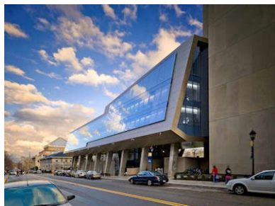
Mascaró Center for Sustainable Innovation University of Pittsburgh