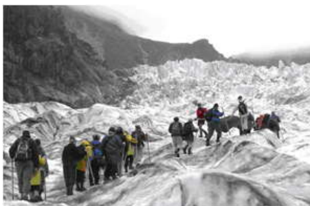
Messiah College students on New Zealand Glacier