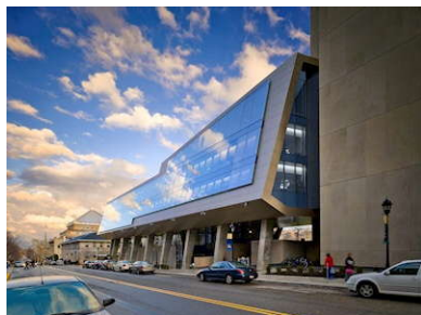
Mascaro Center for Sustainable Innovation University of Pittsburgh