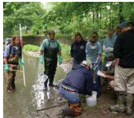
The Behrend College