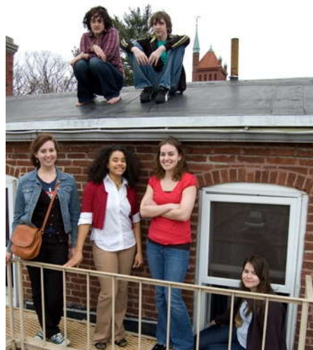
Sustainability House residence Franklin & Marshall College