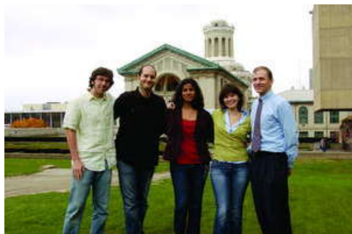
Carnegie Mellon University

PERC's Core Teams work on topics of continuing interest, including: Climate Change and Energy, Sustainability on Colleges & Universities and Sustainable Pennsylvania.