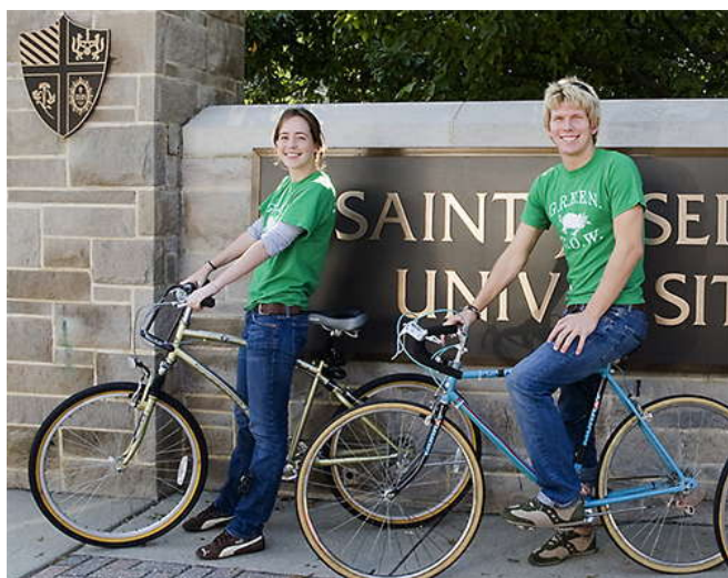
Saint Joseph's University Bike Share Program

PERC serves as a conduit between government and foundation research needs and multi-school research studies . The results of that research have been incorporated into a number of real world actions.