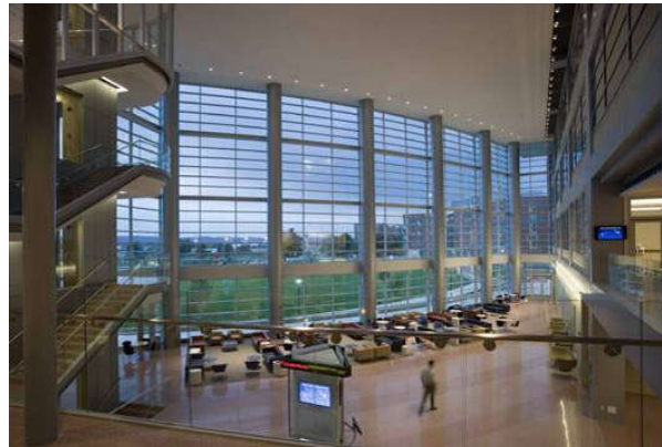
Pennsylvania State University